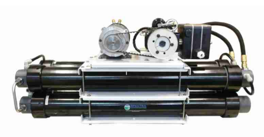
Pearson Pump with Spectraflux<sup>TM</sup> Membrane assembly

pad display and controls are mounted in sealed enclosure. Service ports with three way valves are included to ease maintenance procedures.